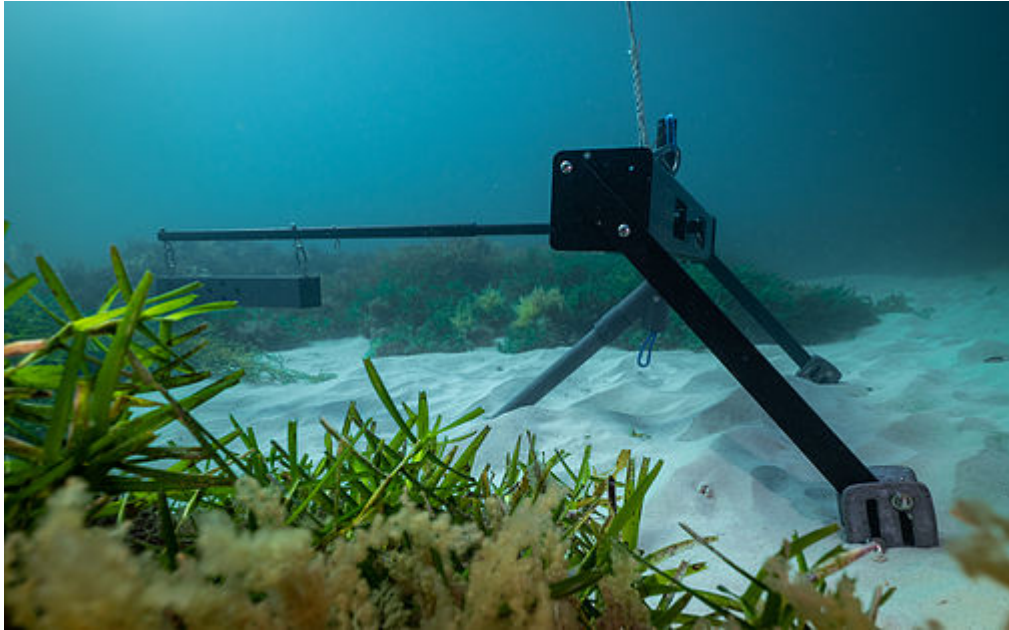
Figure 1. Seabed BRUVS.

For more information on how seabed and mid-water BRUVS are deployed and used, see Bouchet et al. (2018) and Langlois et al. (2018).